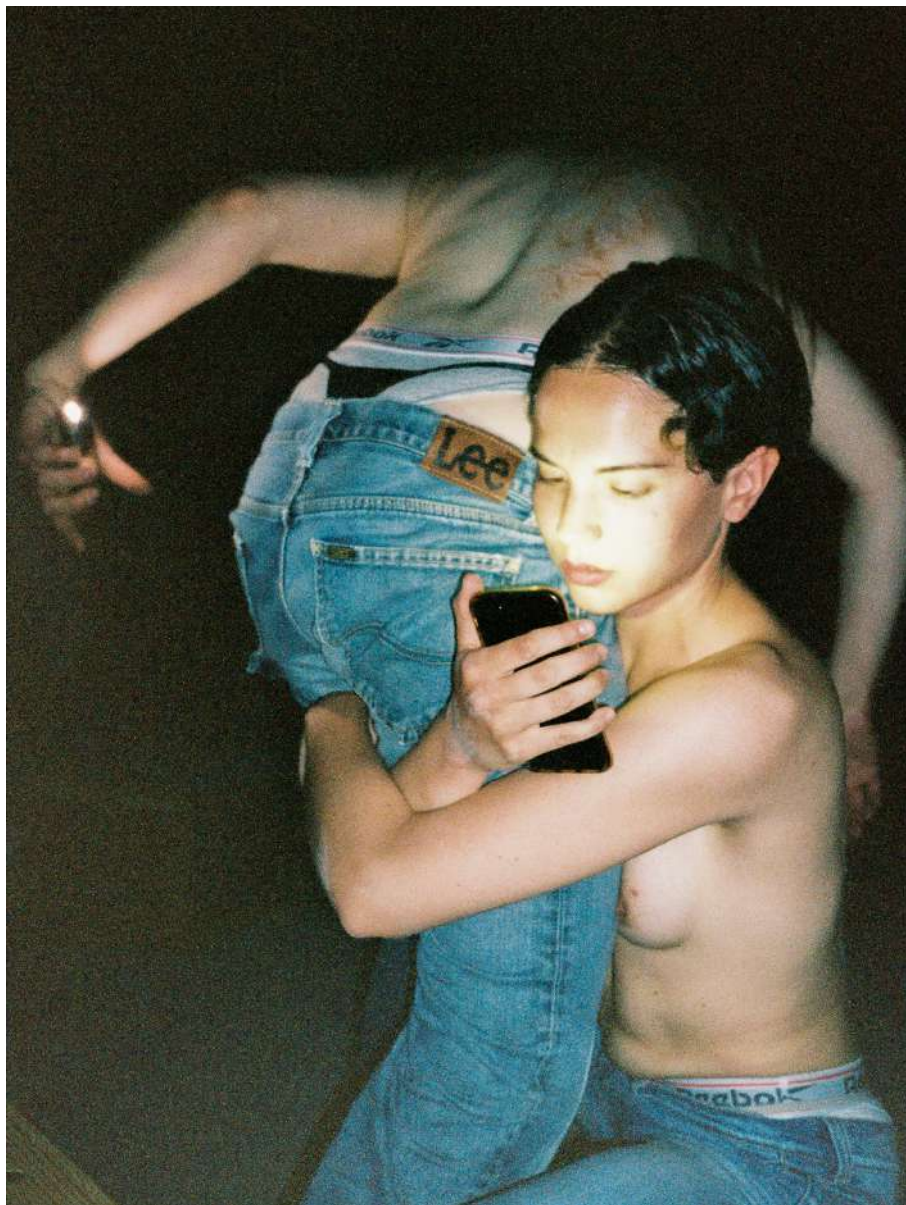
Documentation photograph; performance 60 min

Orenstein & Koppel Lofts, Berlin, DE 05.04.2022