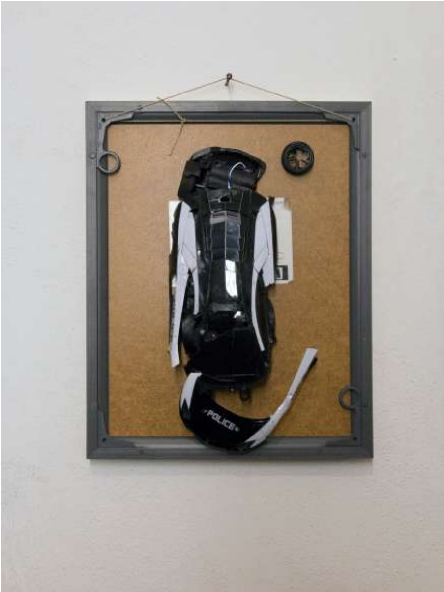
HOLD ON THIGHT DURING THE RIDE, Picture frame with broken police toy car 30.5x24.5cm