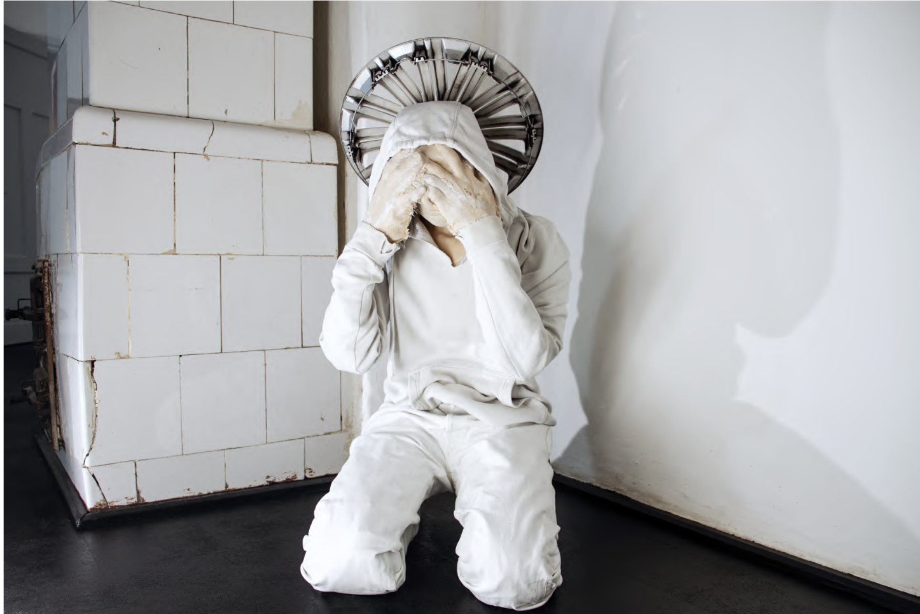
Documentation photograph; figurative sculpture, live size, white clothing, car wheel sheet

Crash Club, Warsaw, PL 13.01 - 10.02.2024