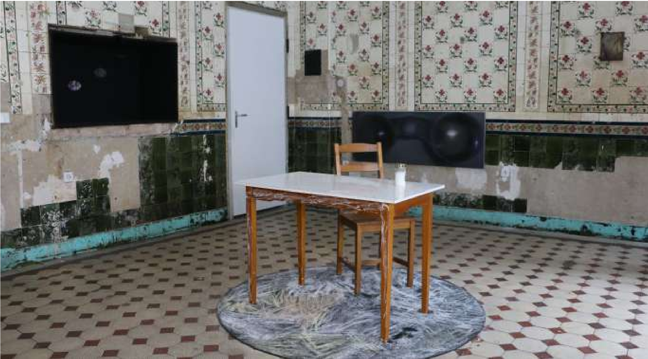
Installation view; wooden chair and table with chalk, construction mats, grave yard candle

BENDING SPINES, Berlin, DE 01.12 - 03.12.2023