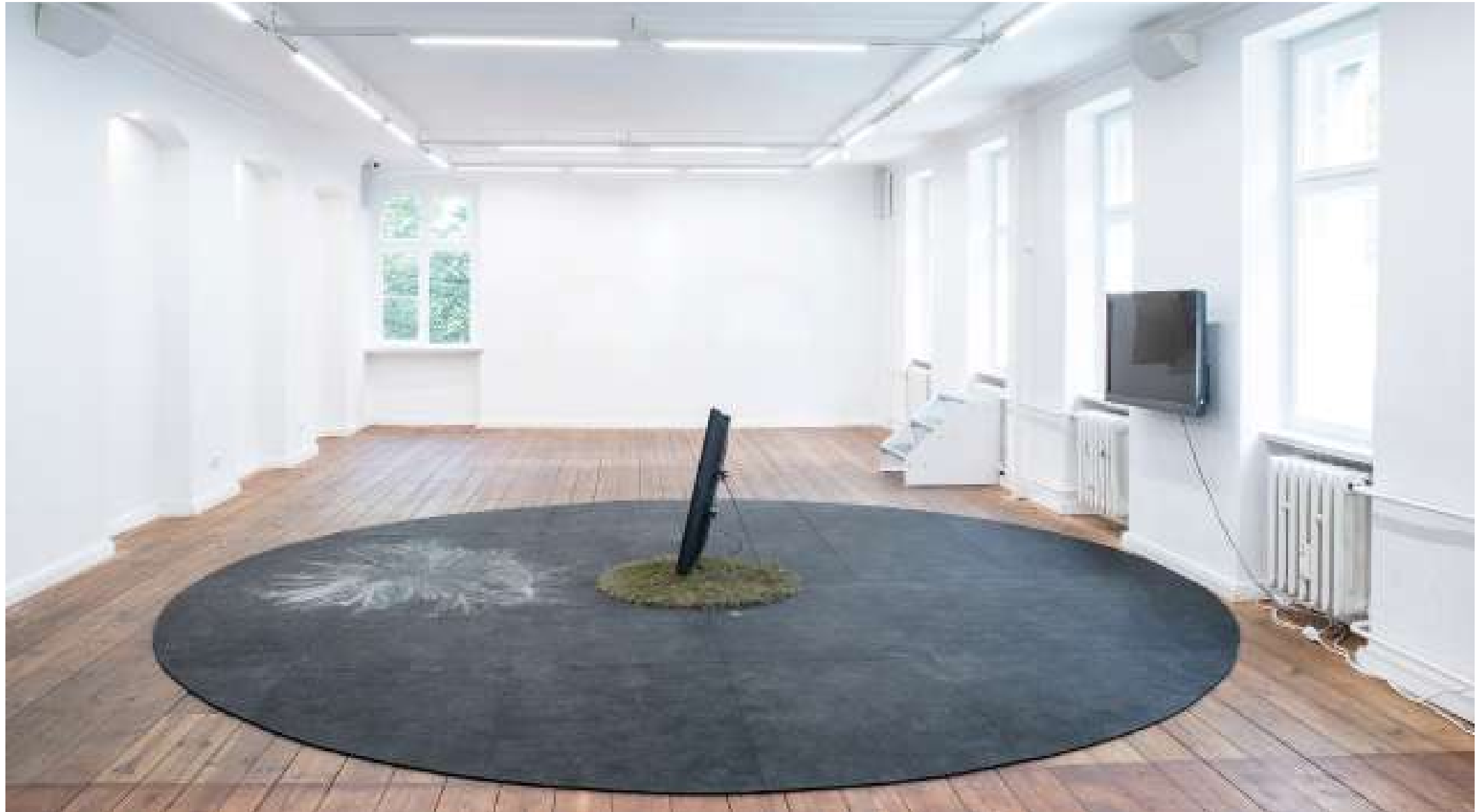
Installation view, construction mats ø 480 cm and sod, ø 90 cm, Plasma TV with looping slideshow 11'11", plasma TV on turf

ALL THE WORLDS A STAGE, Studio Hanniball, Berlin, DE 17.09 - 11.11.2022