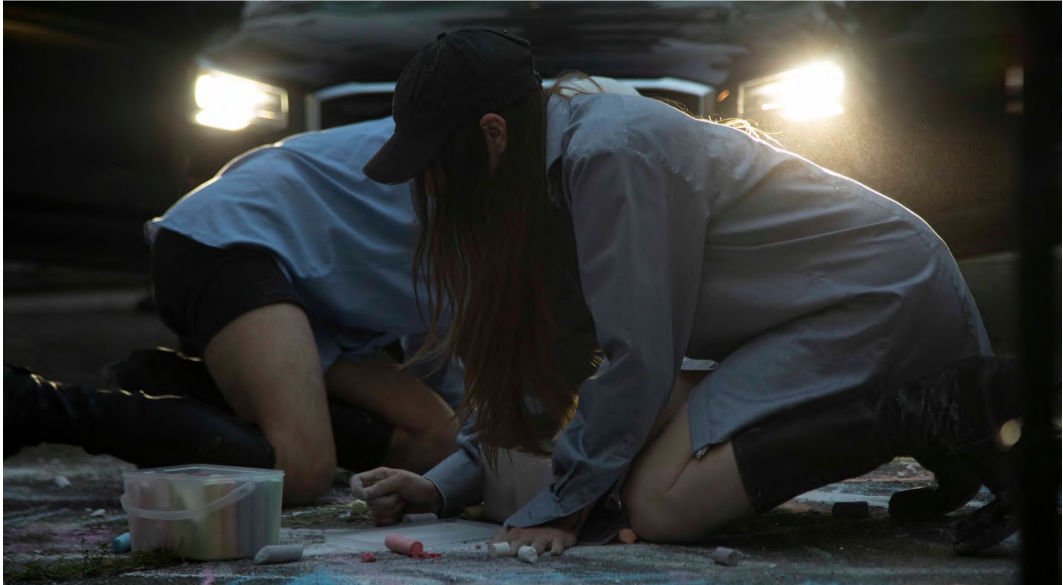
physical and virtual performance in three acts, 120 min, work by duo practice: Deividas Vytautas + Gloria Viktoria