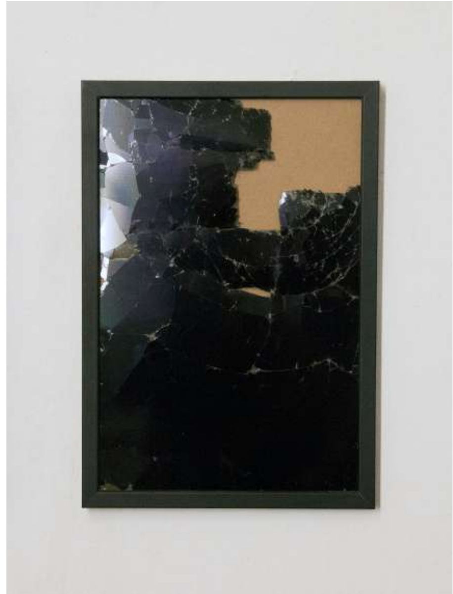
NOT ENTERTAINED, Picture frame with broken plasma TV screen 32.5x22.3cm