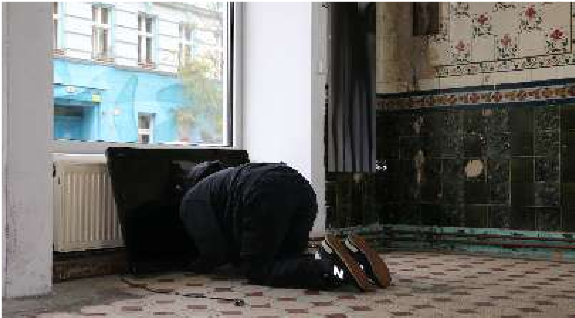
Installation view; figurative sculpture, live size, black clothing and shoes, plasma TV