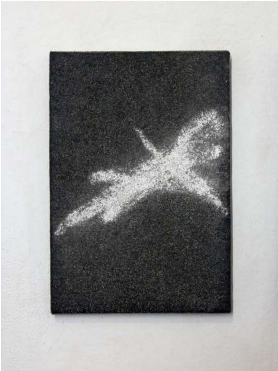
HAPPY PLAY, Bitumen panel with chalk 33x22.5cm