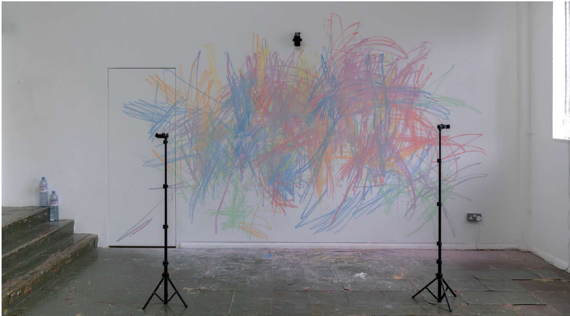
Installation view; performance, phone mount, tripods, chalk, Evian water bottles, TV monitor, video, overall dimensions variable

Todestrieb, Generation & Display, Lodnon, GB 11.05.2024 - 18.05.2024