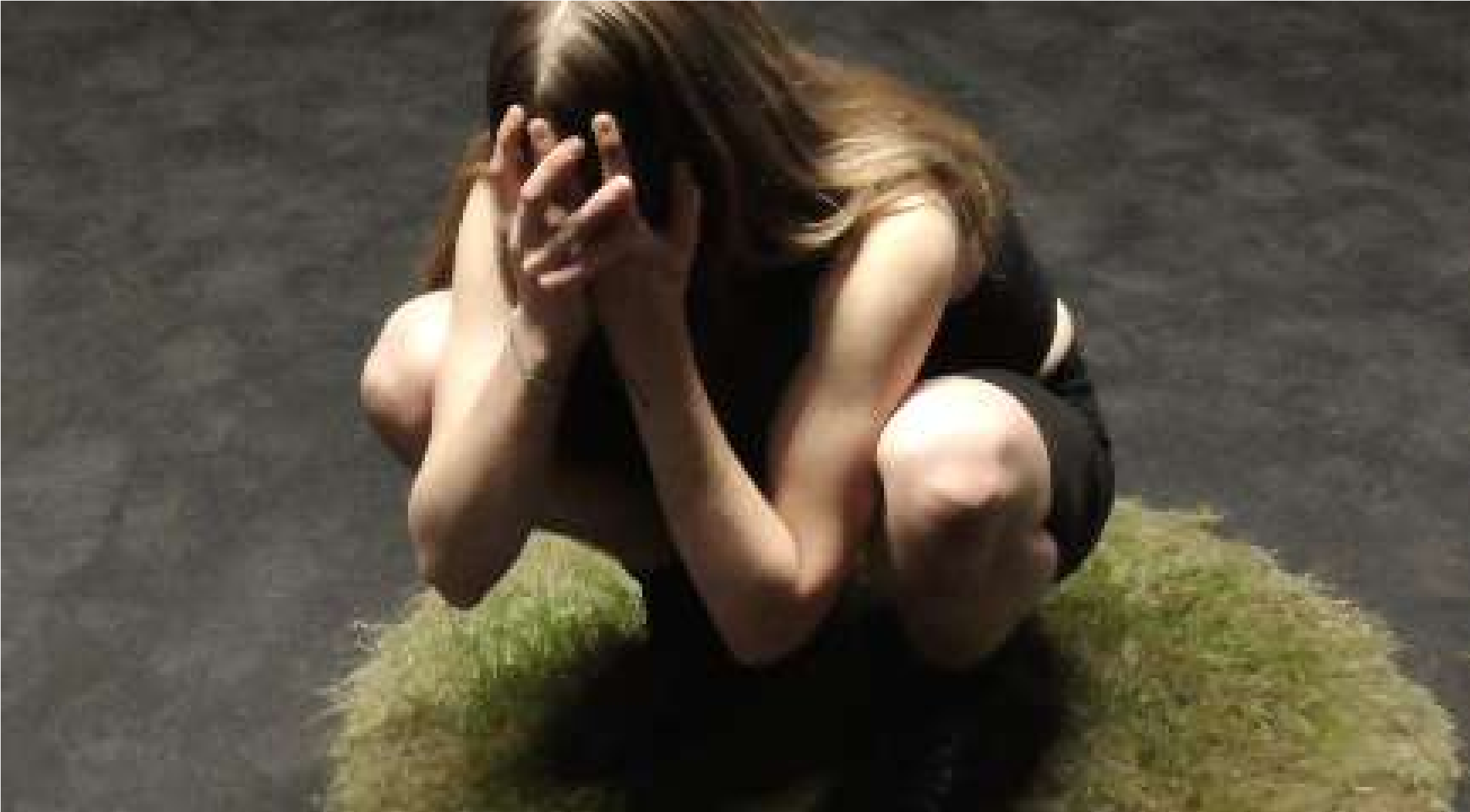
Documentation video still; performance, 11 mins, camrecroder, color, audio in collaboration with Ewa Pointowska