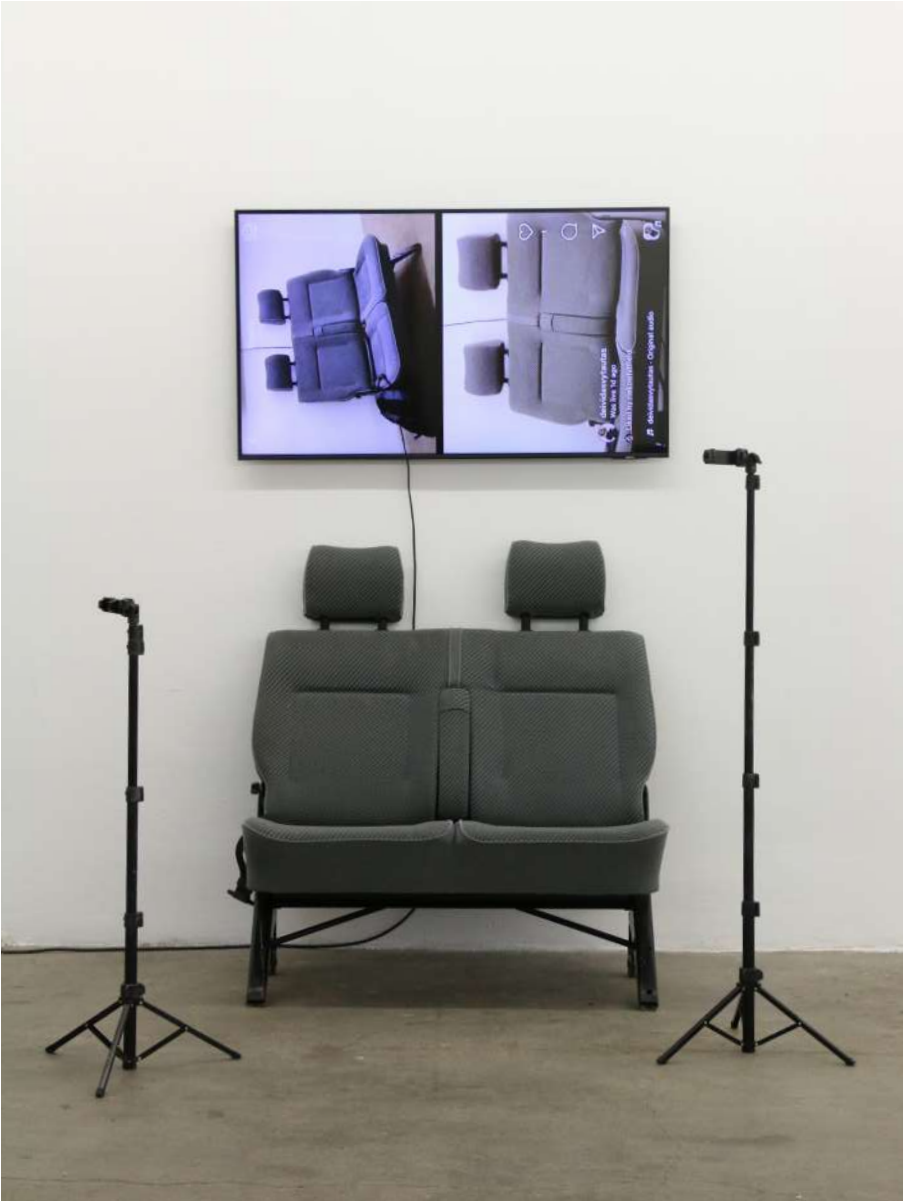
Installation view; car seats, tripods, tv screen, iphone, livestream recording of documentation: unedited, original audio

Escapismus, Kunstpunkt Berlin, DE 19.04.2024 - 05.05.2024