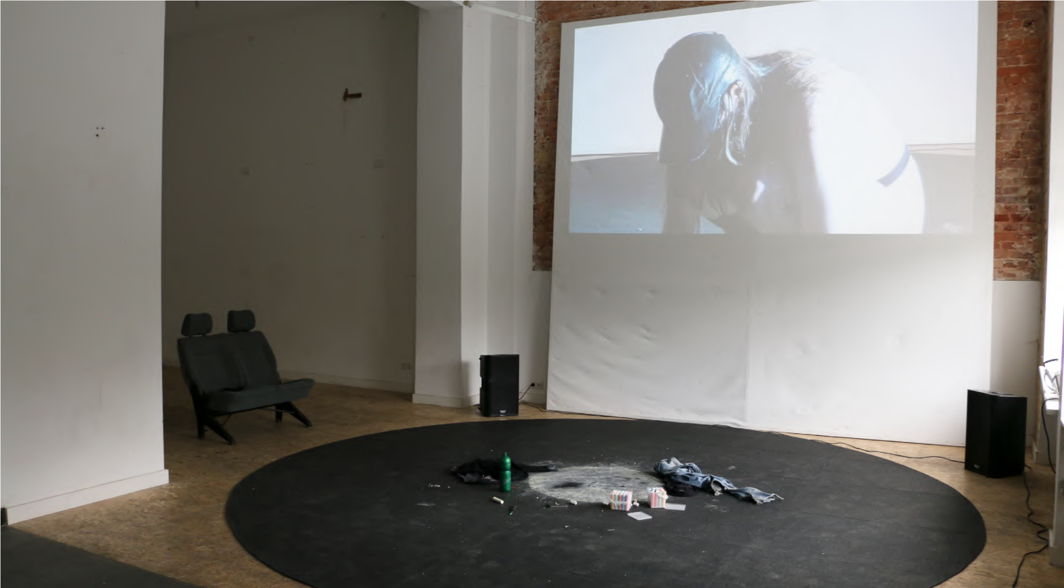
Installation view; bitumen panels, chalk, jeans, hoodie, water bottle, car seats, video documentation of performance (40 min), original audio

Installation at Molt, Berlin, DE 03.08 - 05.08.2023