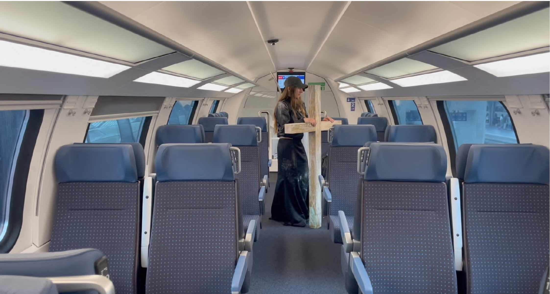
Still of video recording by Nastasia Tuszynska; performance 180 min, Iphone 14, color, original audio