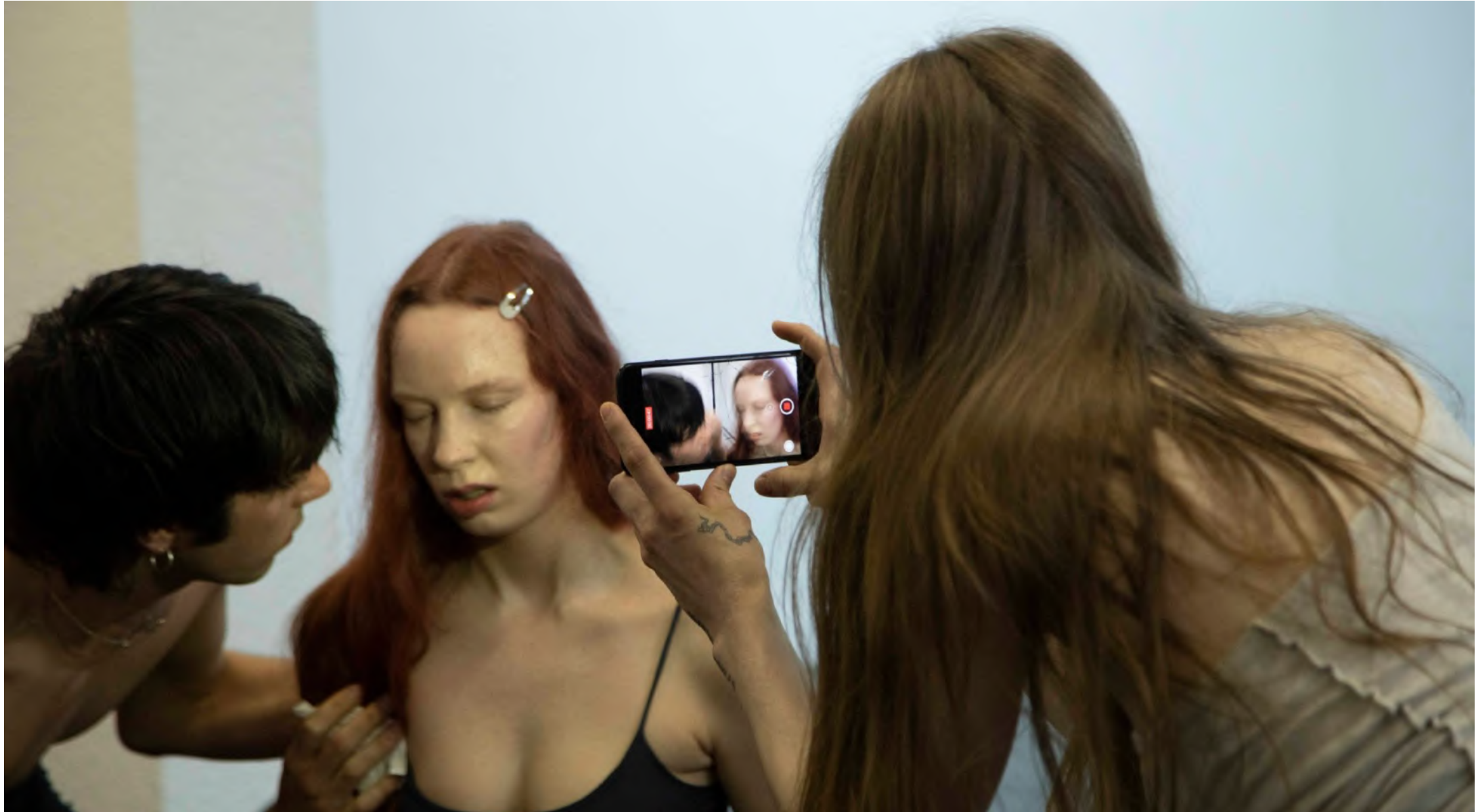
performance 40 min, collaboration with Deividas Vytatutas Aukščiūnas and Jette Loona Hermanis