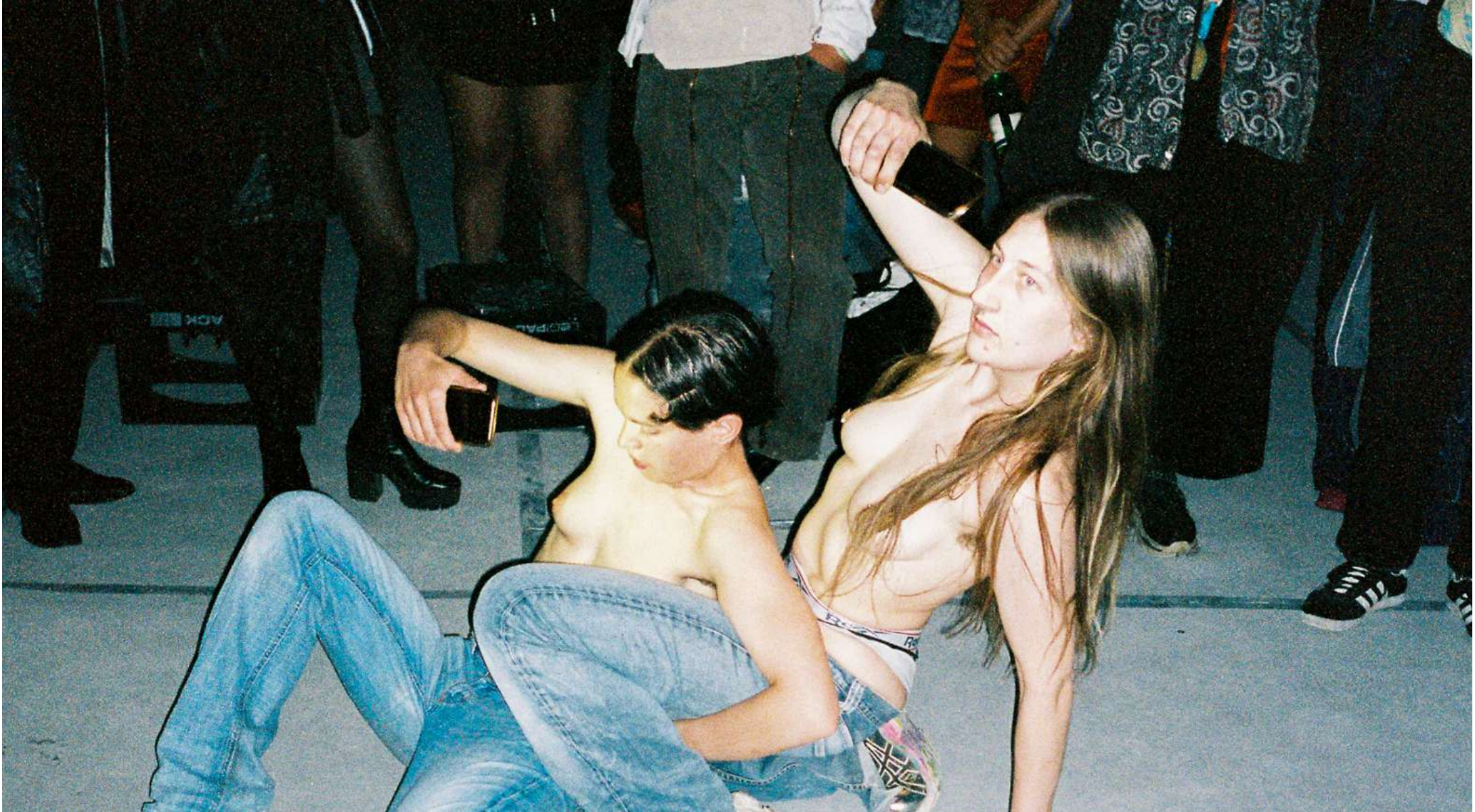
Documentation photograph; performance 60 min