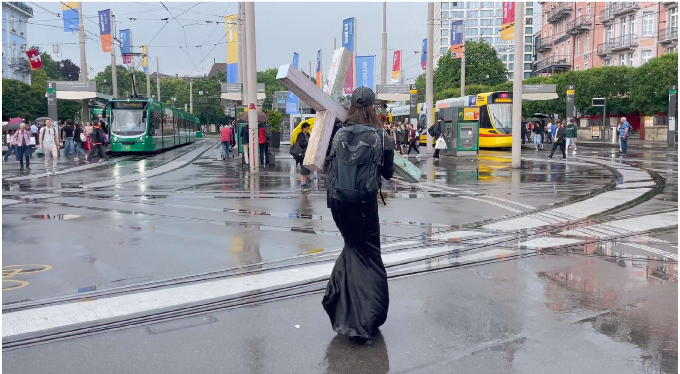
Still of video recording by Nastasia Tuszynska; performance 180 min, Iphone 14, color, original audio